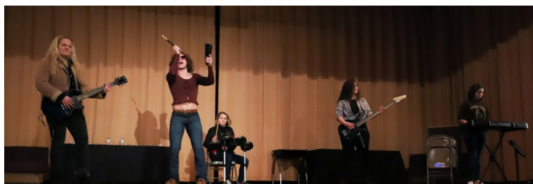
Musicians performed the classic Saturday Night Live skit titled "More Cowbell."

The Loudonville-Perryville School Foundation thanks the Class of 2019 for their great production of "Senior Night Live," and congratulates them for continuing the now 20-year tradition of Senior Projects.