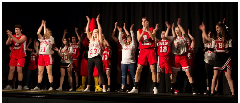
Last March the stage of the Ohio Theatre was filled with lots of talented students and staff members, including many Class of 2017 members shown above.