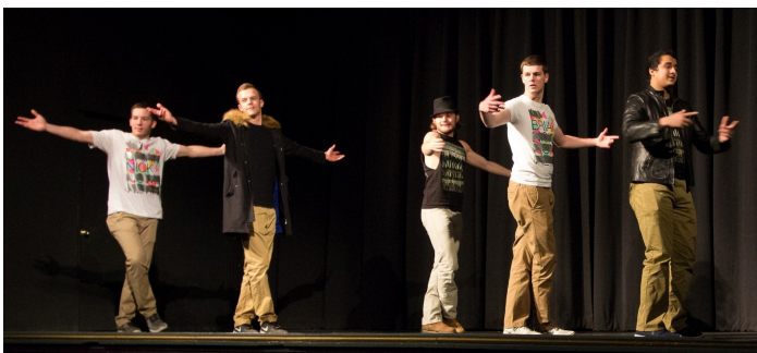
Left: Students perform "I Want It That Way" by the Backstreet Boys.

The Loudonville-Perryville School Foundation thanks the Class of 2017 for their wonderful production, and congratulates them for continuing the now 18-year tradition of Senior Projects, which do good things in our community!