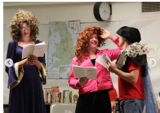
The Class of 2015 presented the Shakespeare tragedy Othello , but purposely turned it into a comedy. The event included a spaghetti dinner.

Please encourage your friends to become first-time donors in 2017.