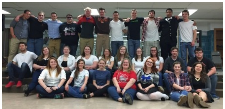
Members of the Class of 2016 celebrate after the LHS Talent Show.

An estimated crowd of 200 watched a variety of acts, including