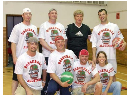
In 2006 the team from Beano's won the first of four dodgeball tournaments.

We would like to send a big "Thank You" to all of our business donors for their support.