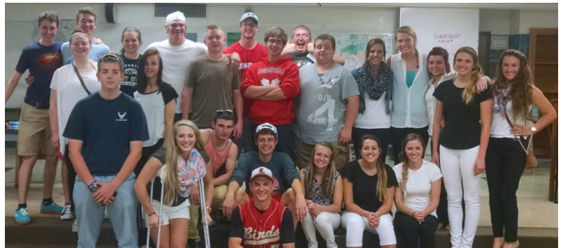
Members of the Class of 2015 celebrate after the Saturday evening production of Othello .

Featuring an all male cast and the modern "No Fear Shakespeare" translation, the production followed the original and tragic story-