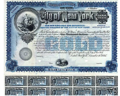
This is an old bond with the 10 coupons you actually clipped off every year.

ing in a bond, where you receive an interest payment every year, and then get your original investment back when the bond matures.