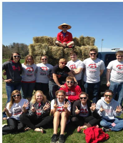
Members of the Class of 2014 celebrate the completion of the Tuffy Run.

The Extreme Run was approximately 2 miles long and included six obstacles. A total of 31 runners