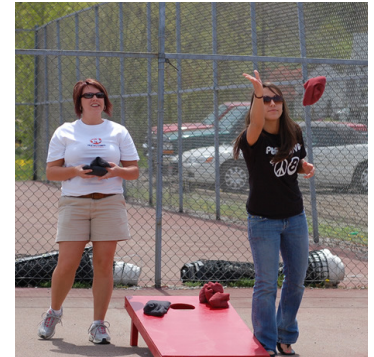
A senior girl plays cornhole.

Our intent is to provide one grant each year to the L-P Schools, and that grant will be approximately 5% of our fund balance. That will allow LPSF to grow our fund balance, and thus provide increasing support to