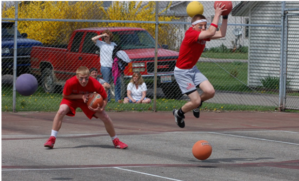
Members of the "El Diablo" team try to stay in play.