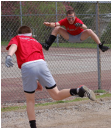
Teammates practice their moves.

The Class of 2008 also applied for (and received) grants from several other foundations, including the Hugo and Mabel Young Foundation, the Milton and Beulah Young Foundation, the Park Foundation, and the WalMart Foundation. In total, the Class of 2008 was directly responsible for raising $7,154, which is the most raised by any graduating class since these efforts were started with the Class of 2000.