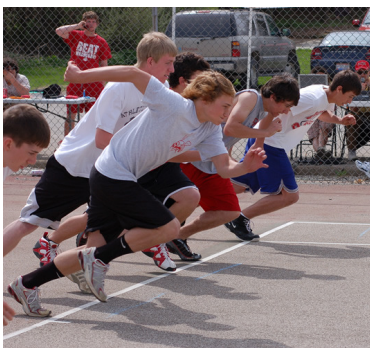
A team races to grab dodge balls at the start of the game at last spring's Senior Class Project, a combination dodgeball and cornhole tournament.

The year 2008 was indeed a busy one for the Loudonville-Perryville School Foundation (LPSF for short). As mentioned elsewhere in this newsletter, two major administrative milestones were achieved this year – the incorporation of the Foundation, and our classification as a tax exempt 501(c)(3) organization by the Internal Revenue Service.