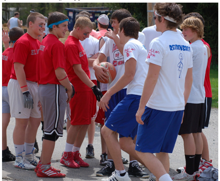
Two rival teams get ready to compete in dodgeball.

To that end, the final major event of 2008 was LPSF's grant of $1,000 to the L-P Schools. These funds helped the school purchase two sets of Active Expressions student response systems – hand-held units that work in conjunction with the school's electronic whiteboards. The junior high and the high school will each receive one of these sets. Helping the L-P Schools stay on the cutting edge of technology is always important, and the LPSF is proud and pleased to assist with this technology purchase.